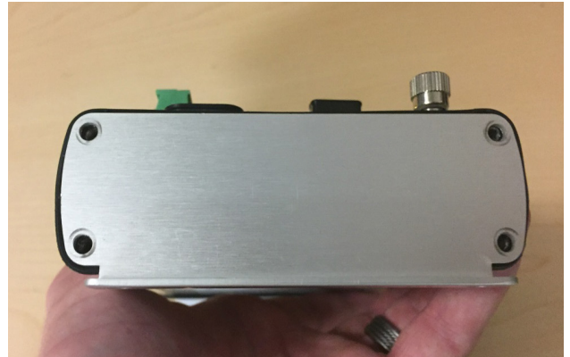
Figure 10: Bottom mounting plate lining up with the holes

Insert the 4 screws and tighten until snug.