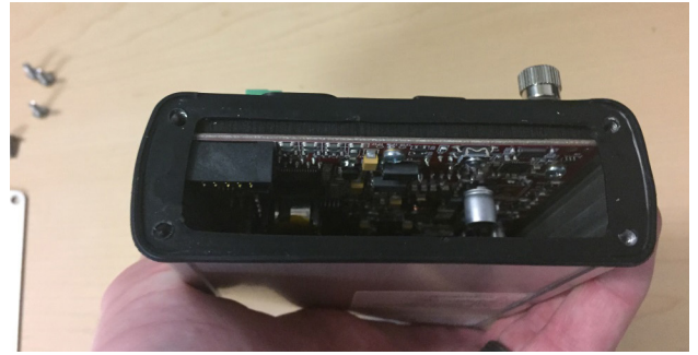
Figure 9: Place rubber gasket onto bottom

8 Flip the Storm over and place the rubber gasket on the bottom side into place (Figure 9).