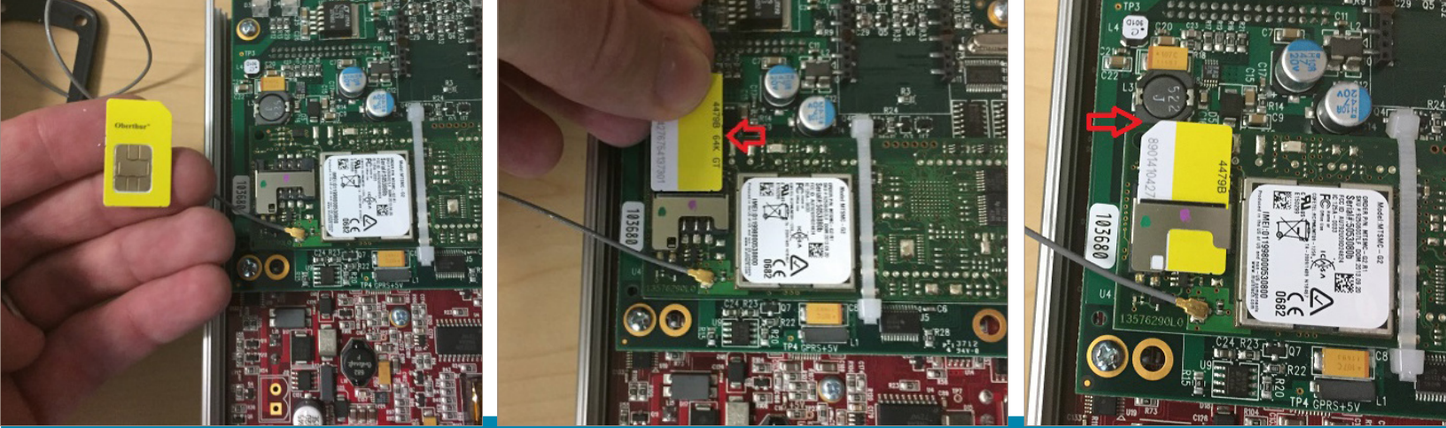
Figure 6: Replacing the SIM card with one from your own local carrier