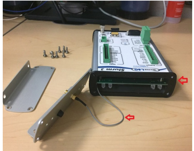
Figure 3: Showing plate with antenna attached, and the rubber gasket

Once the plate is pulled away, slide the rubber gasket down the cable so that it is loose from the main case.