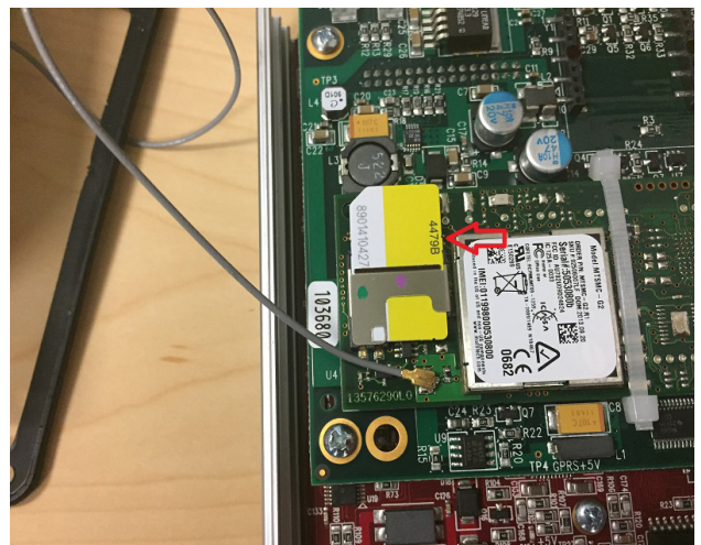
Figure 5: SIM card location on modem board

Locate the SIM card on the green modem board just above where the antenna cable connects to the board (Figure 5).