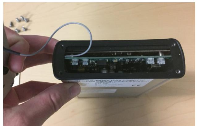
Figure 8: Slide rubber gasket into place