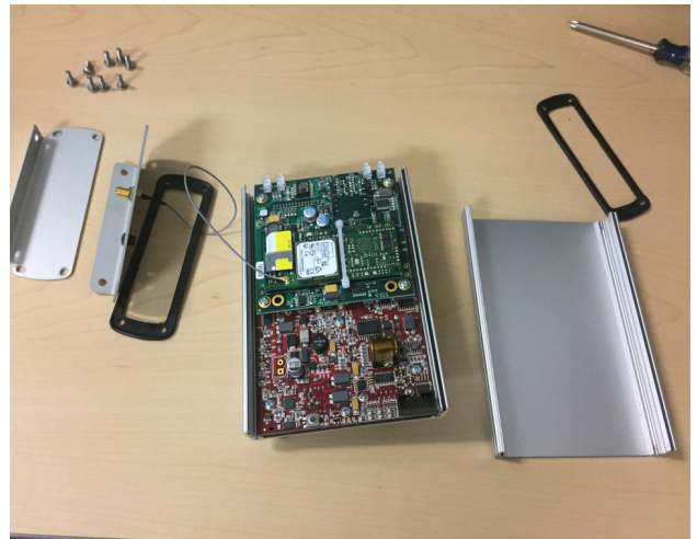
Figure 4: Storm 3 case separated

Separate the two halves of the main Storm 3 case by carefully pulling them apart (Figure 4).