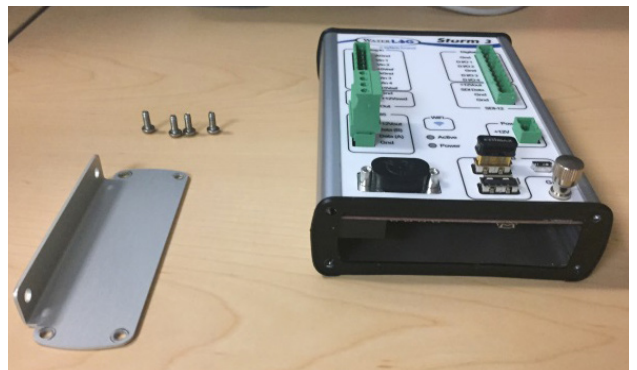
Figure 2: Bottom plate and four screws removed