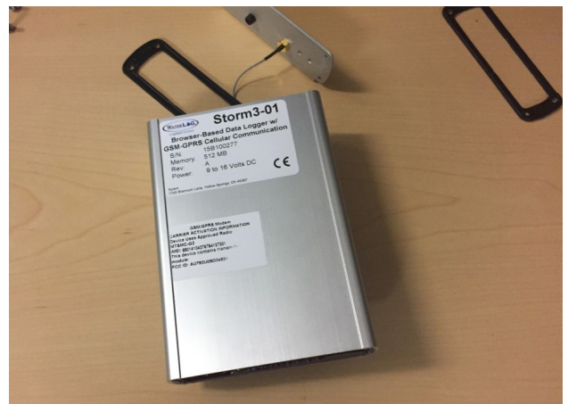
Figure 7: Begin reassembly of Storm 3